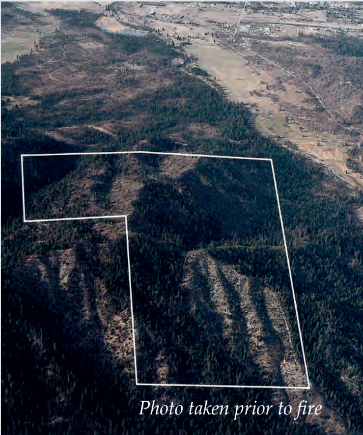
Photo taken prior to fire