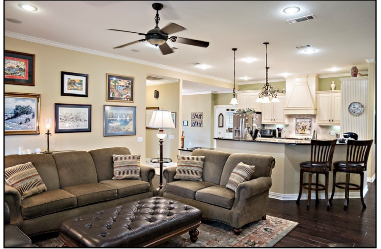
Den / Main Living