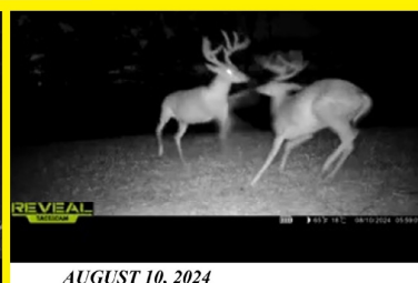
AUGUST 10, 2024

NOTE: ALL deer camera photos shown on this page were taken from Deer Cameras placed ON THE PROPERTY and provided by the owner! These are NOT stock photos.