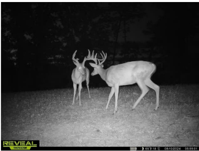
AUGUST 10, 2024