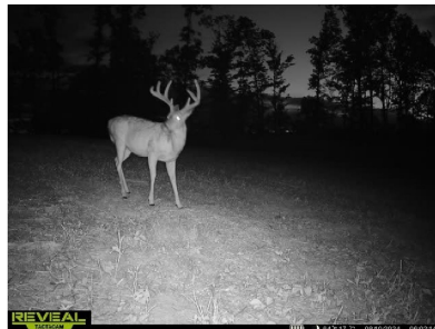
AUGUST 10, 2024