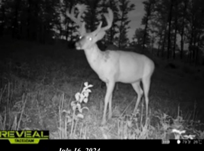
July 16, 2024