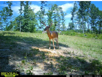
August 10, 2024