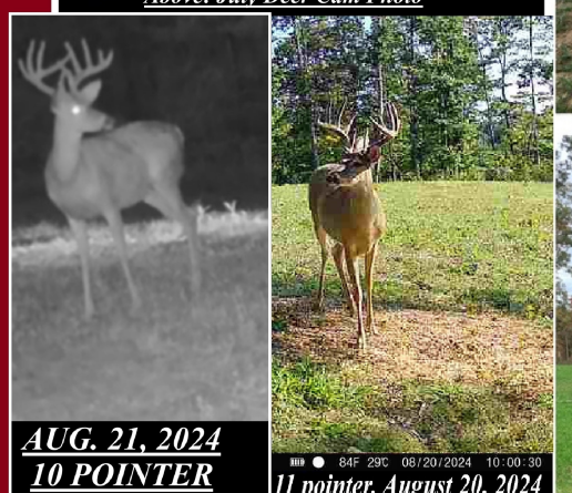
AUG. 21, 2024 10 POINTER