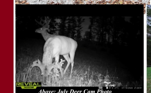
Above: July Deer Cam Photo