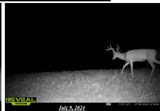
July 9, 2024