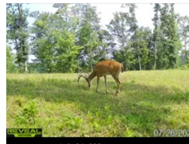
July 26, 2024