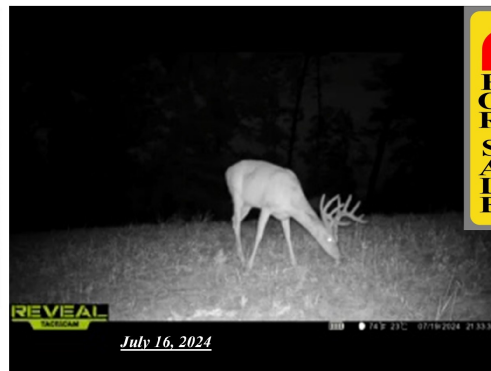
July 16, 2024