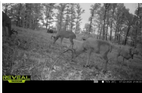
4 Bucks on the property, July 22, 2024