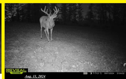
Aug. 11, 2024