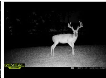
AUGUST 10, 2024