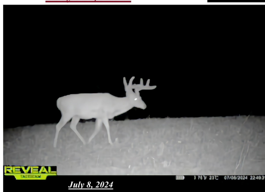
July 8, 2024