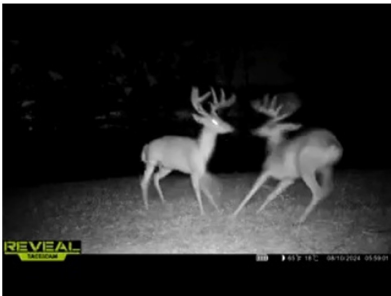
AUGUST 10, 2024