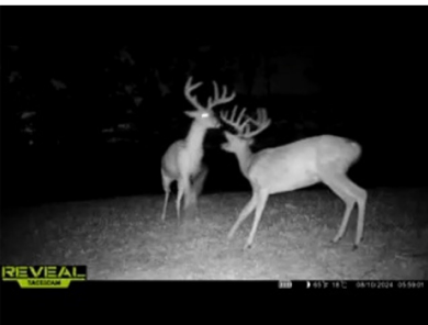
AUGUST 10, 2024