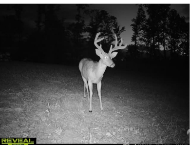
AUGUST 10, 2024