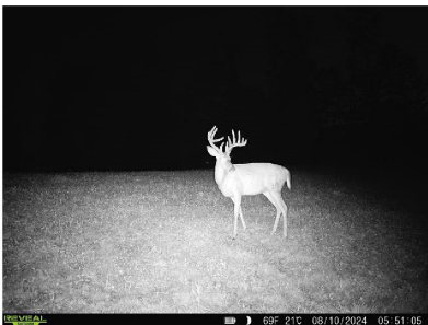
AUGUST 10, 2024