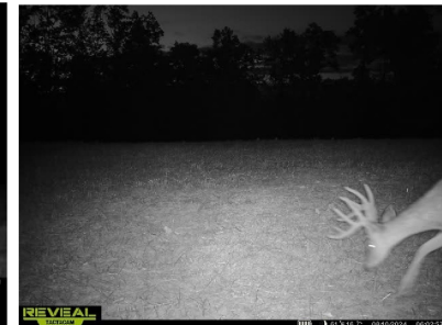
AUGUST 10, 2024