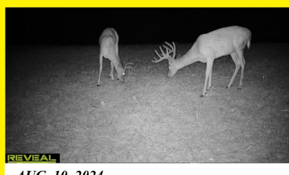
AUG. 10, 2024