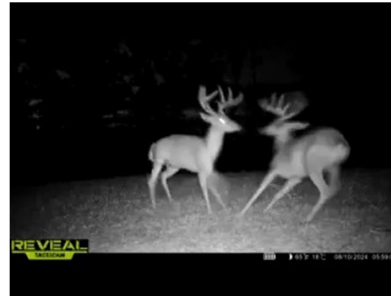
AUGUST 10, 2024