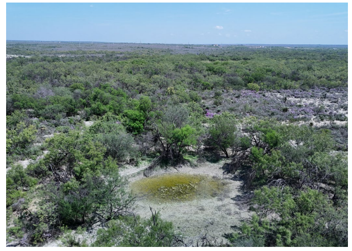
701± Acres Val Verde County