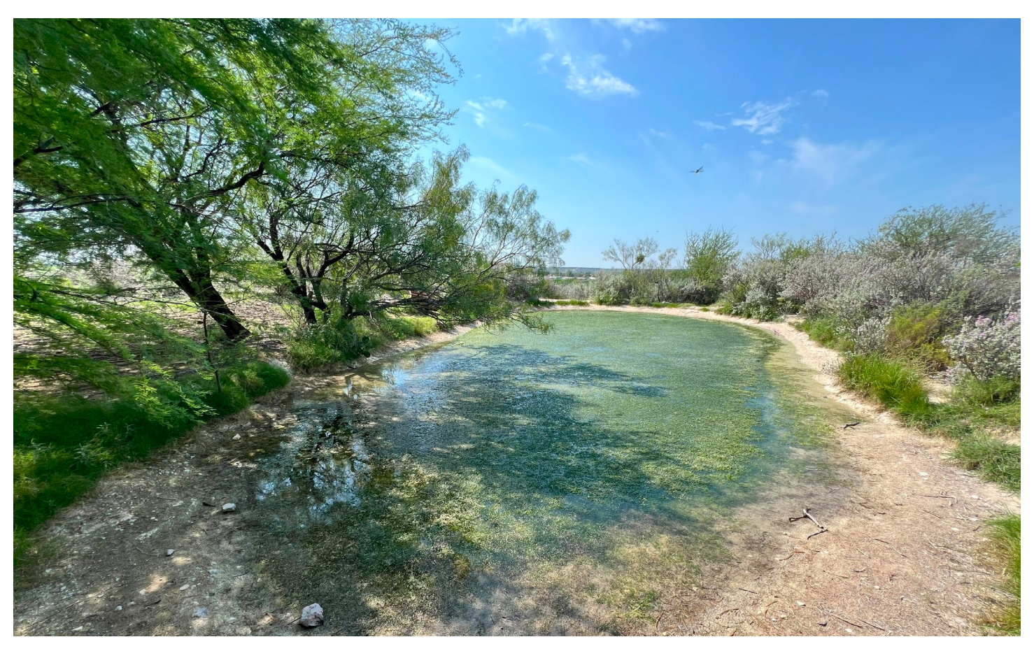
701± Acres Val Verde County