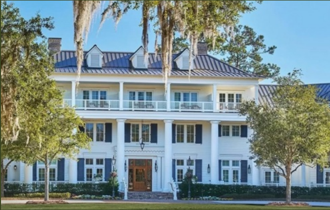
MONTAGE AT PALMETTO BLUFF