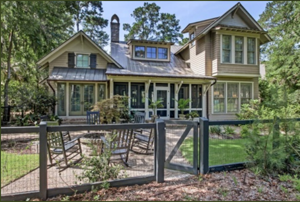
LOW COUNTRY ARCHITECTHURE