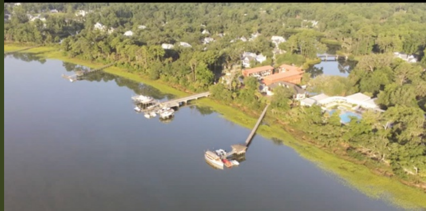
WILSON MARINA & CANOE CLUB