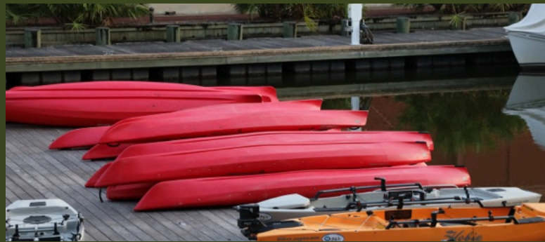
THE CANOE CLUB