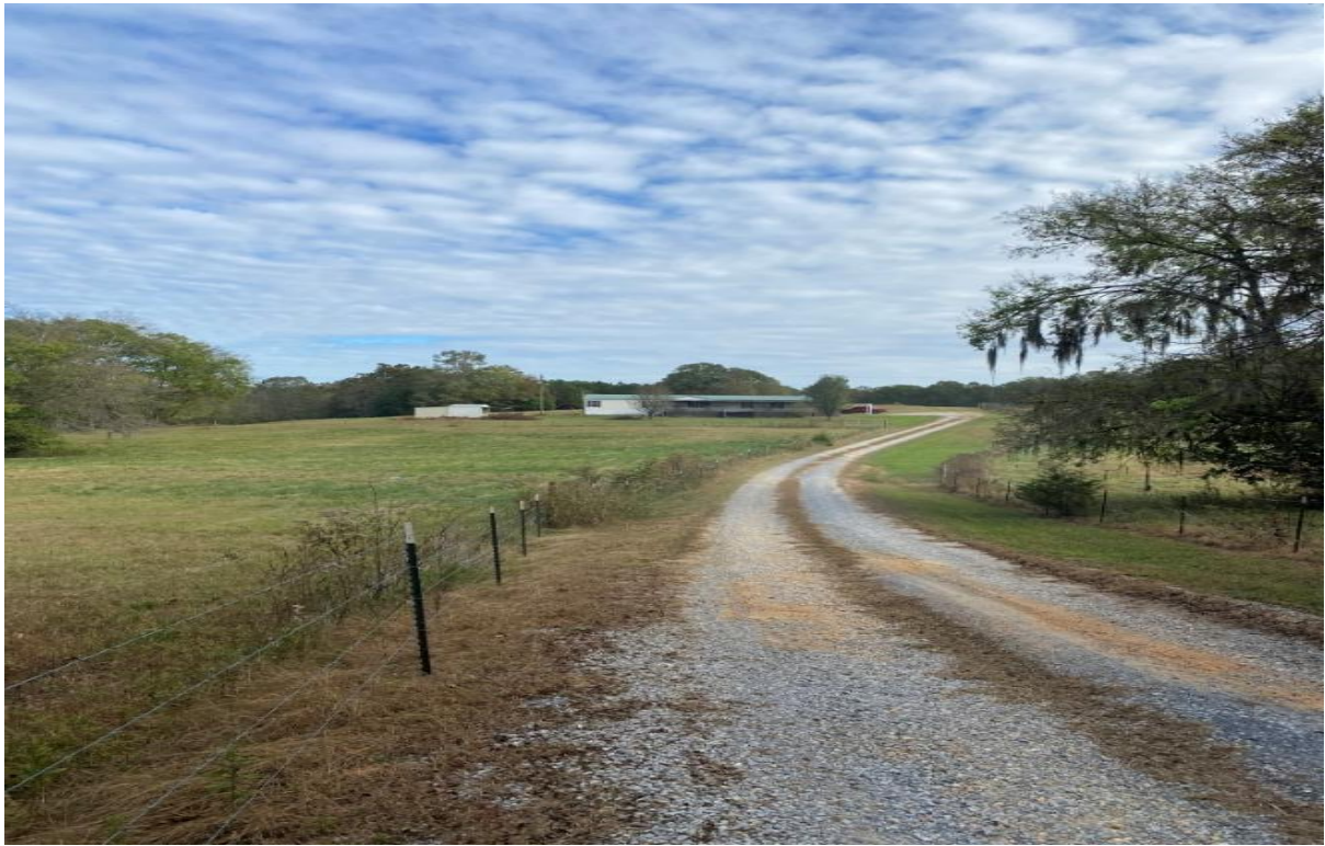
Lot 1 Sold