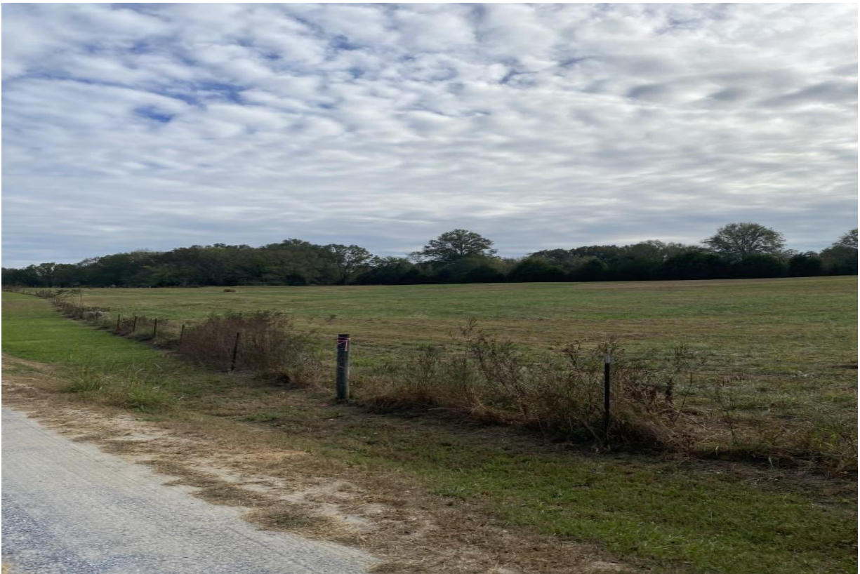
Lot 2 6.68 acres