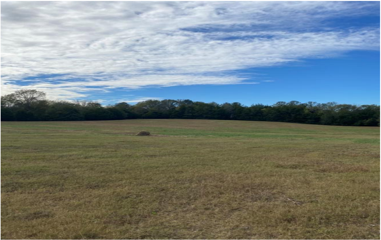
Lot 2 6.68 acres