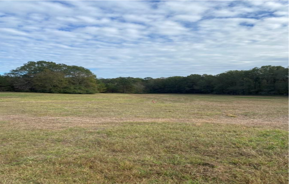
Lot 3 12.93 acres