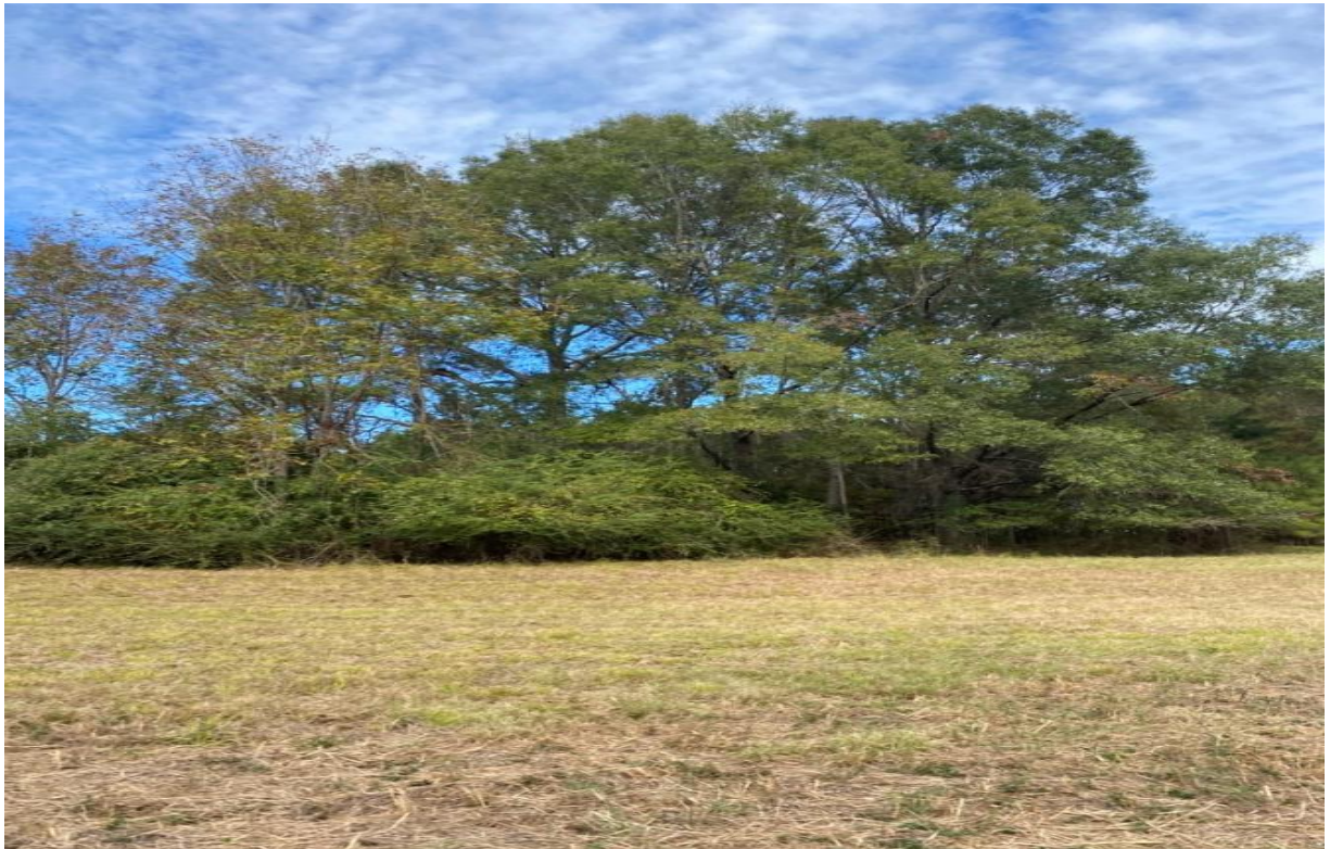
Lot 3 12.93 acres