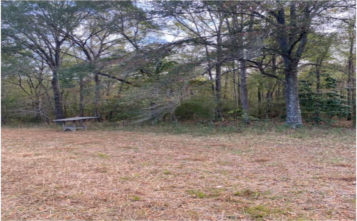
Lot 3 12.93 acres