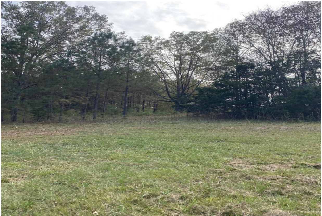
Lot 3 12.93 acres