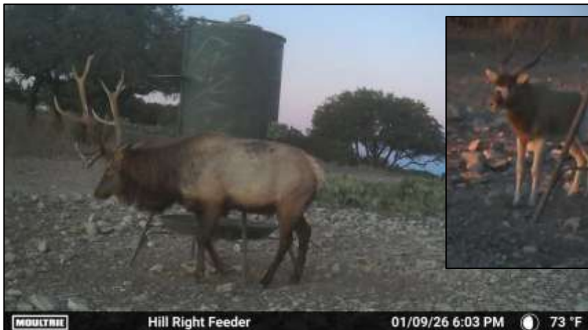
MOULTRIE Hill Right Feeder 01/09/26 6:03 PM 73 °F