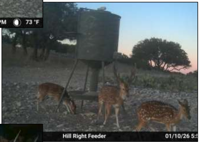
Hill Right Feeder 01/10/26 5:00 PM