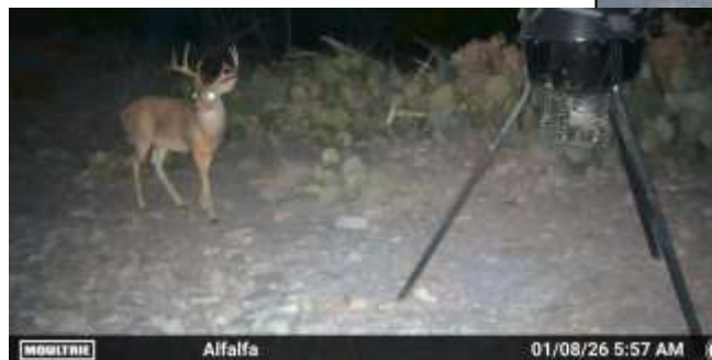
MOULTRIE Alfalfa 01/08/26 5:57 AM