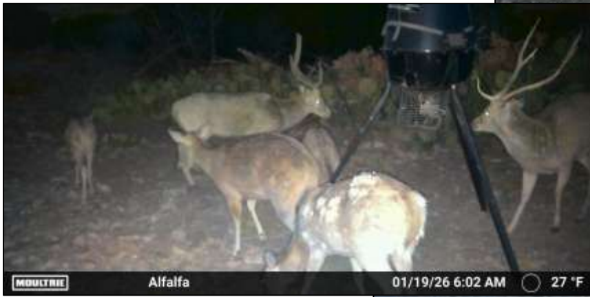
MOULTRIE Alfalfa 01/19/26 6:02 AM 27 °F